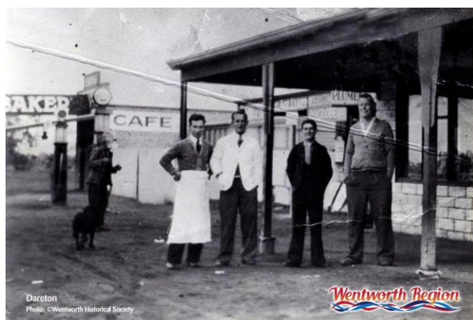
Dareton